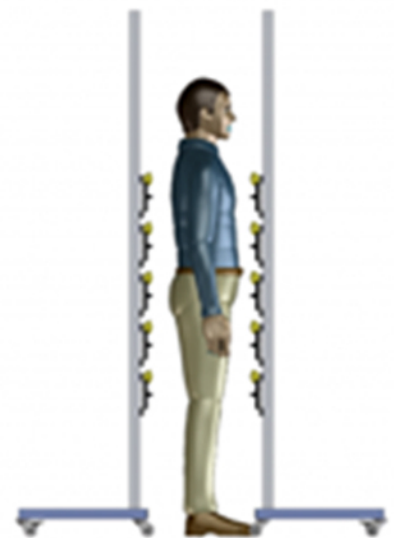
Schematic View of Plasma Coil Unit.

The health team in Poland now has one medical doctor and one naturopath with further doctors' applications pending. Doctors who need supplies of various GANs, but lack time or expertise to produce them, are supplied by the students. One of the private students has even donated a Plasma Coil Unit for the doctor to use in their practise. Medical research continues in different directions, outcomes of which will soon be presented in the KF Plasma Scientific Journal .